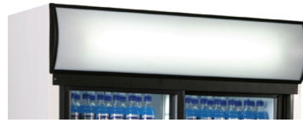
Large advertising area