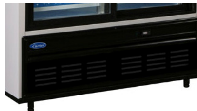
Easy access for maintenance