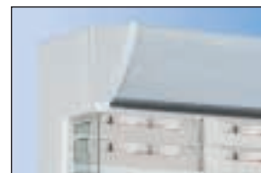
Curved upper front