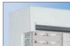
Straight upper front