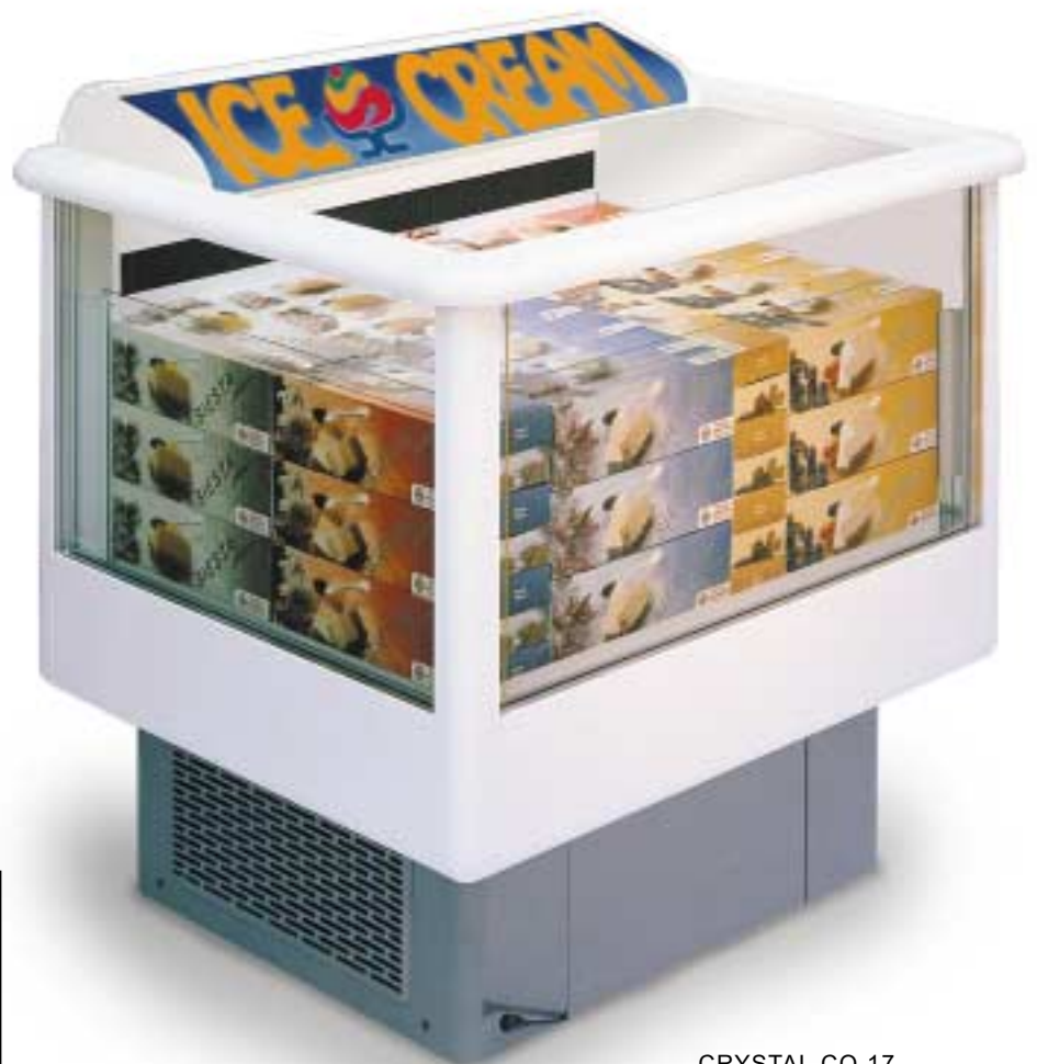
CRYSTAL CO 17