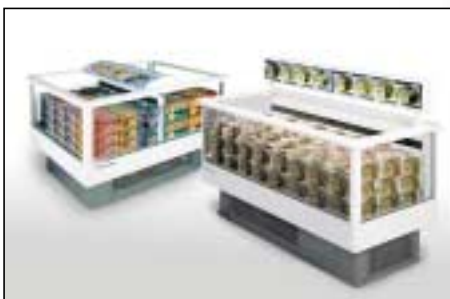
CRYSTAL CO 33, CO 34