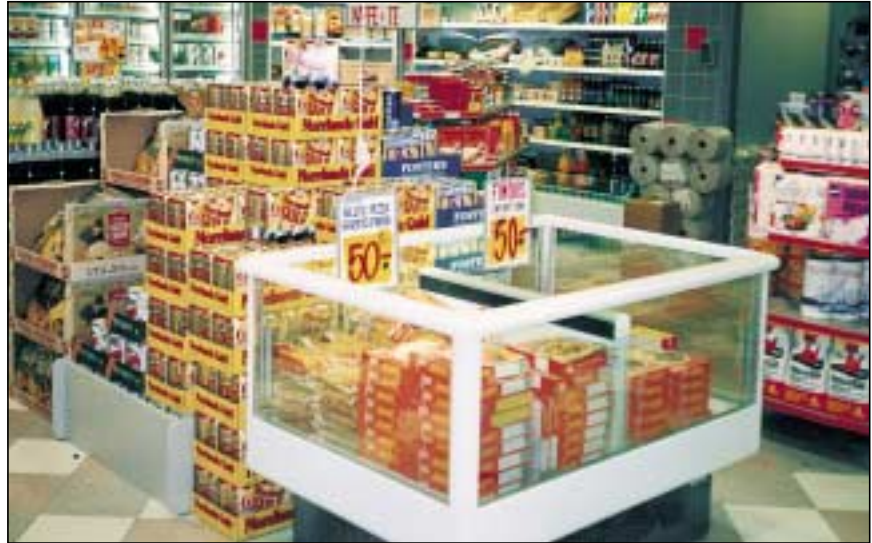
Lightbox Dimensions of transparency